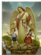
Table Blessings (Latin)

Angel of God, my guardian dear, to whom God's love commits me here, ever this day be at my side, to light and guard, to rule and guide. Amen.